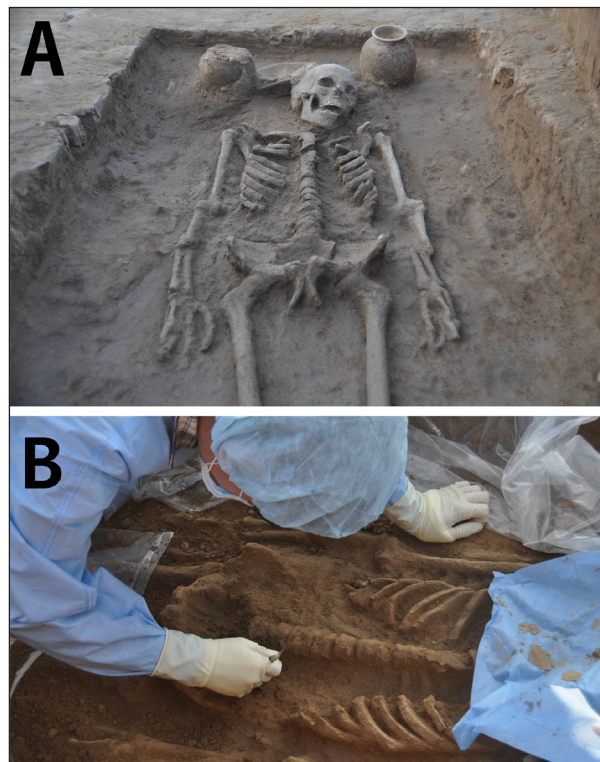
Figure 1: Parasitological sampling at prehistoric cemetery of Rakhigarhi site, the Harappan period megacity. (A) The skeleton at grave. (B) Parasitological sampling from hip bone.

We also collected the specimens of the water facilities (water channels, water lines, bath drains, and reservoirs) in Dholavira, considering that they might have been contaminated by a discharged water from toilets. In parasitological examinations, however, no positive signs were detected in them either. Not only in such water facilities, the ancient parasite eggs were not found in the samples of the residential areas (Gilund, Balathal, Rakhigarhi, Mitathal, Karsola) or of graves (Rakhigarhi and Farmana) ( Table 1 ). We wonder if such a low success rate